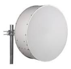
Figure 2: Dish Antennas for Internet Backhaul Link (one of two)

Mounted above tower midpoint. Diameter: 1 at 48", 1 at 72"